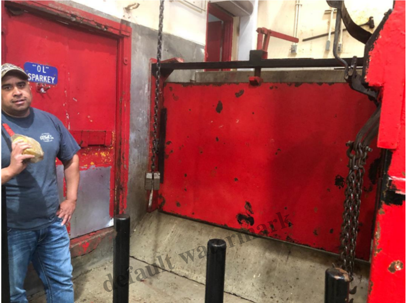
Alaska Meat Packers' Pig in a Poke , DONN LISTON November 5, 2024 https://donnliston.net/2024/11/alaska-meat-packers-pig-in-a-poke/