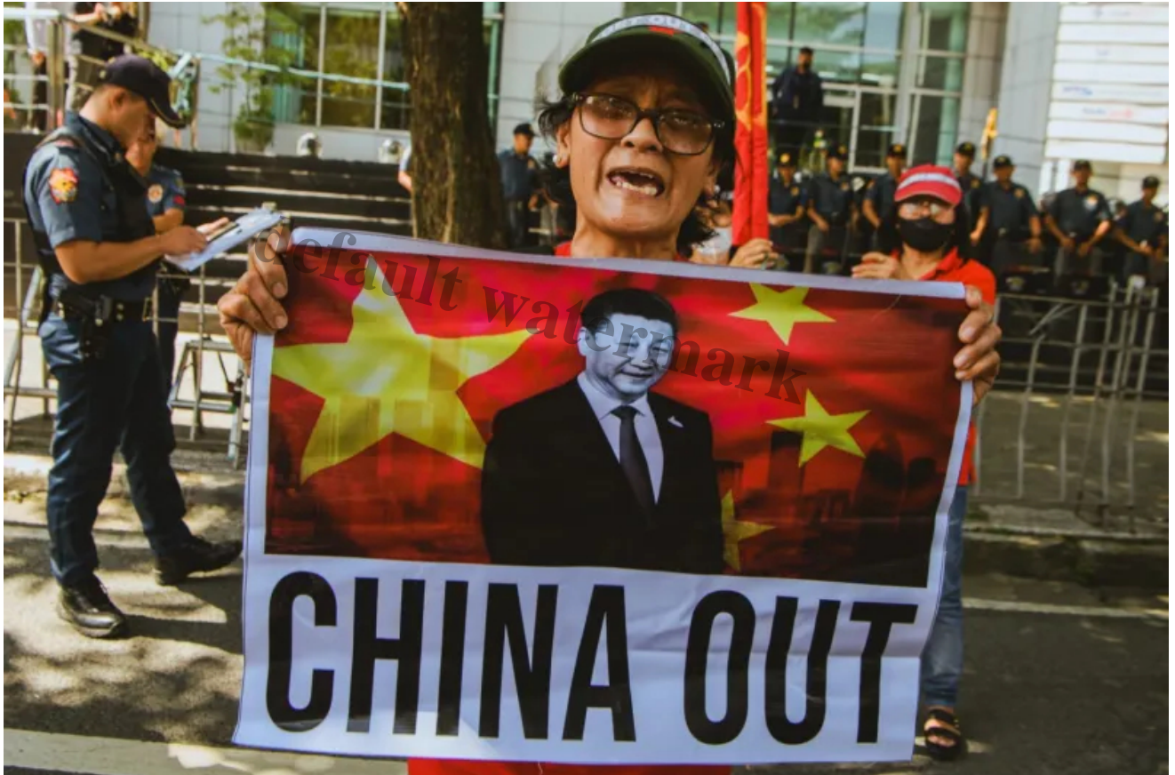
A protester holds a placard outside the Chinese Embassy in Manila on Aug. 11.

[2] With Two Wars Raging, China Tests America in Asia, Foreign Policy