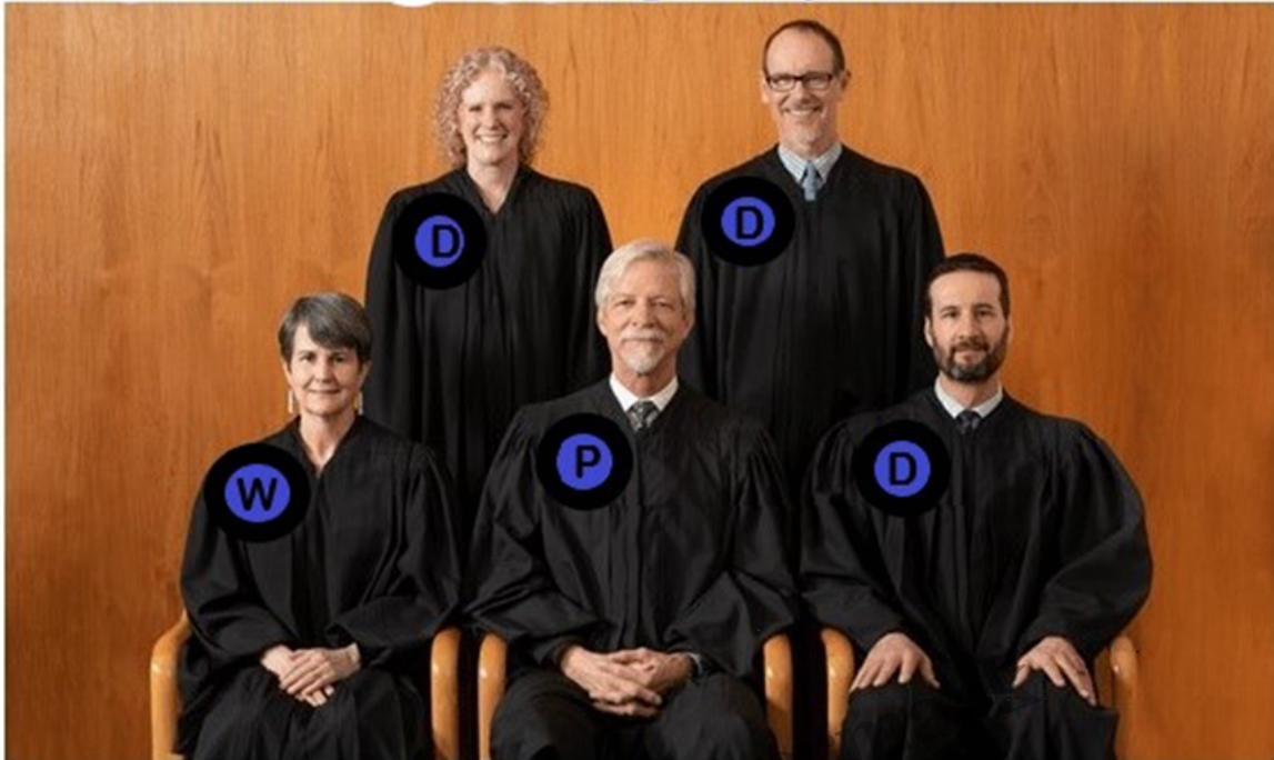
Alaska Supreme Court Justices