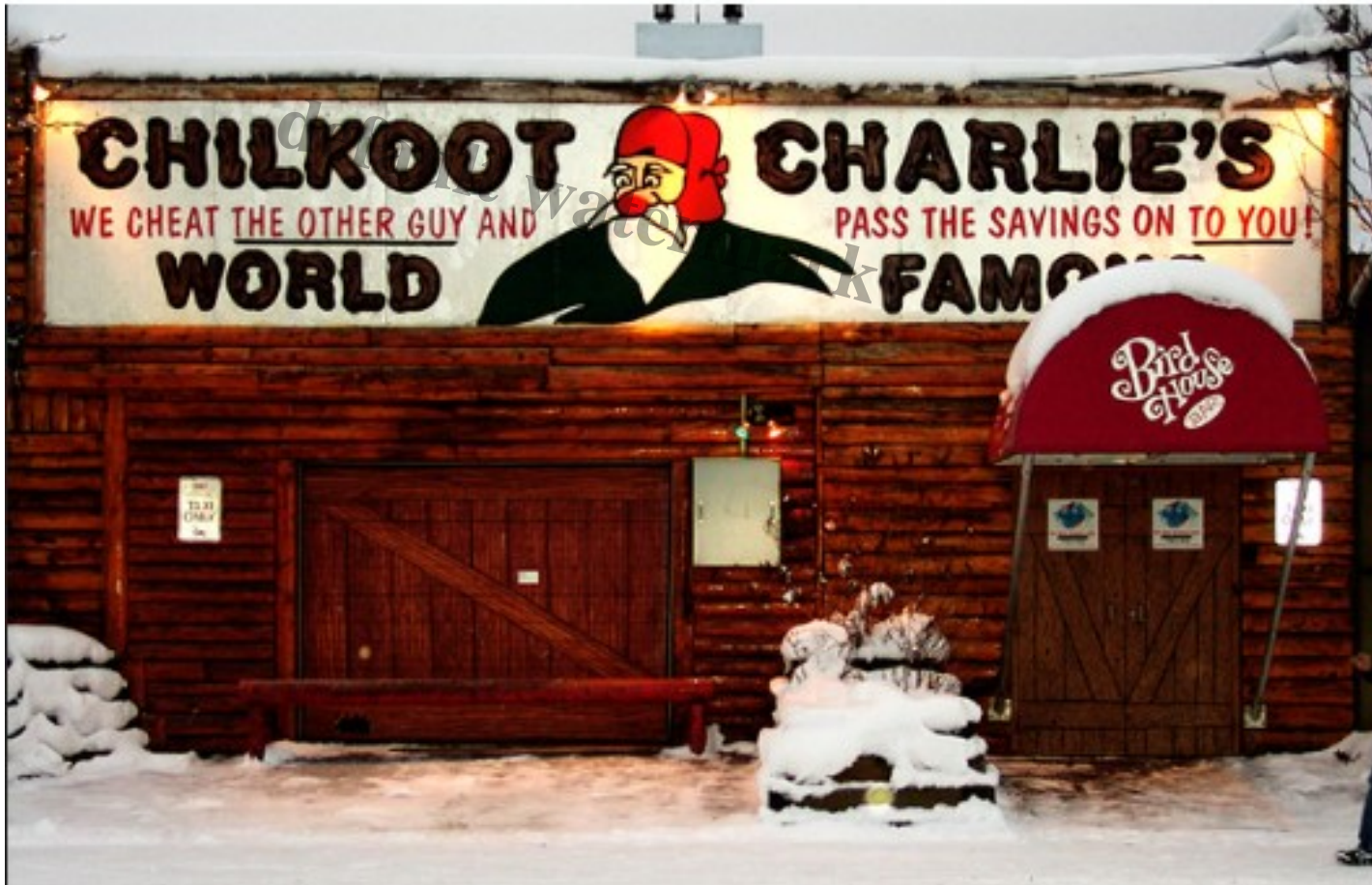
Chilkoote Charlies is a popular bar in Anchorage, Alaska.

2023 Alaska property tax assessment process failed the Haines community, causing local outrage and igniting a now statewide movement to amend State Laws currently allowing cutthroat bureaucrats to drive people off of their property to pay for more government.