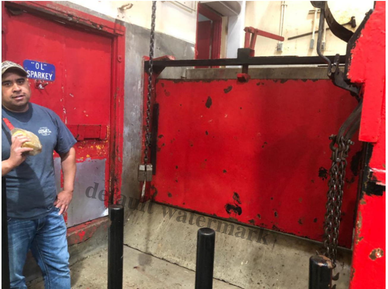
Alaska Meat Packersâ?? Pig in a Poke, DONN LISTON November 5, 2024 https://donnliston.net/2024/11/alaska-meat-packers-pig-in-a-poke/