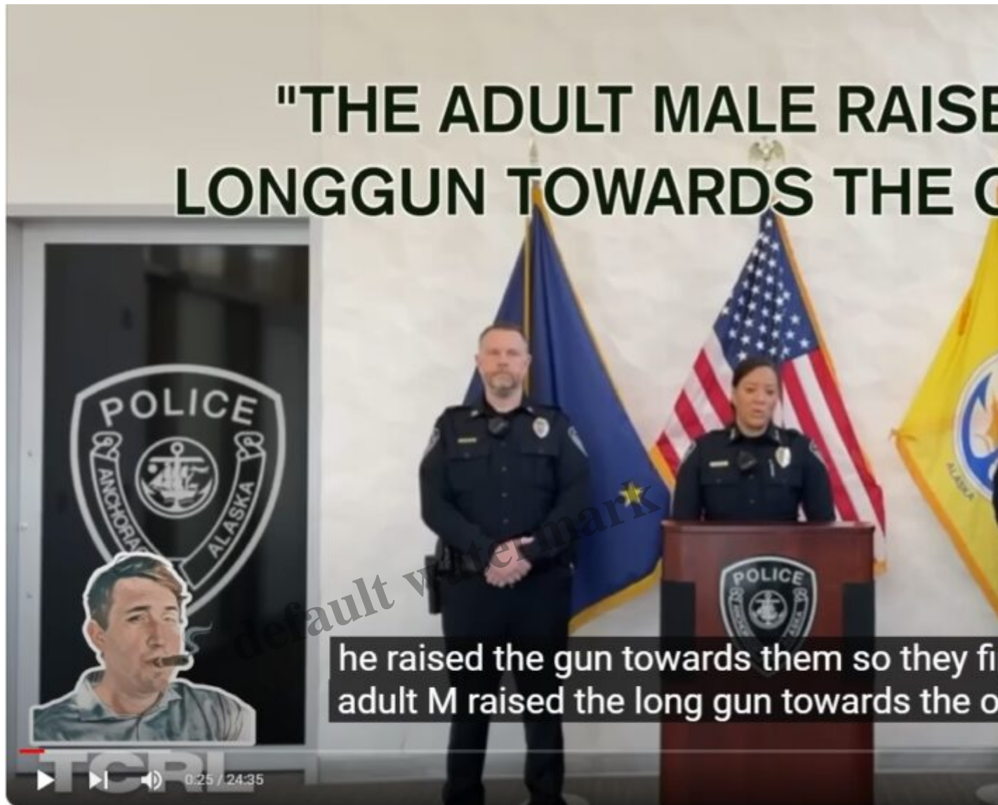
Video Catches Cops in a LIE