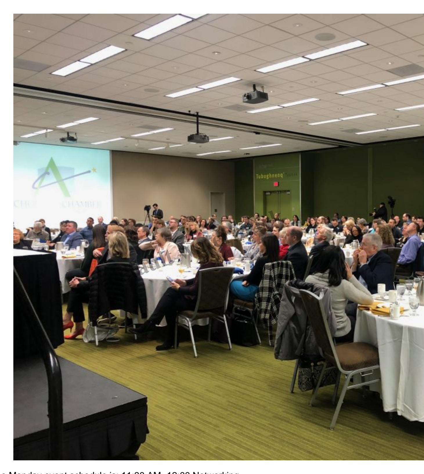
The Monday event schedule is: 11:30 AM -12:00 Networking