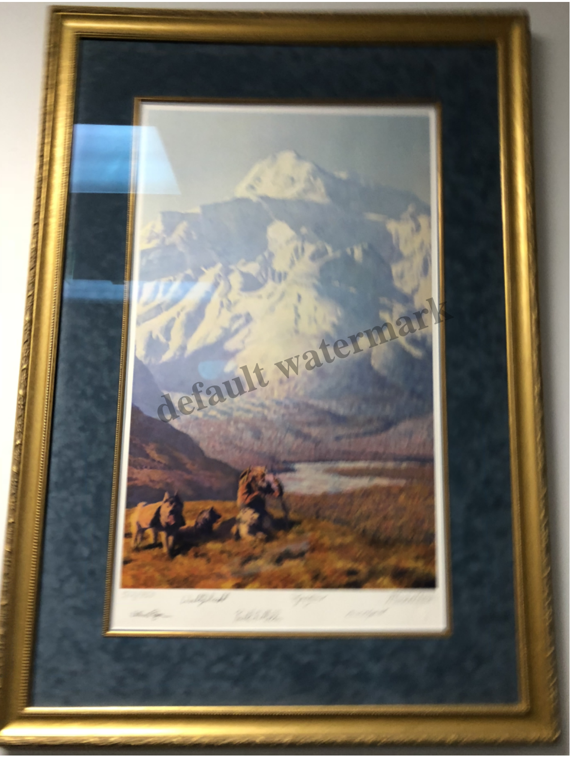
This Alaska Art masterpiece is one of many on display at the Alaska Capitol.

[3]National Museum of Fine Arts (Manila)