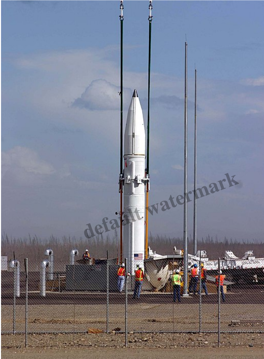
A Ground-Based Interceptor , designed to destroy incoming ICBMs , is lowered into its silo at the missile defense complex at Fort Greely, July 22, 2004.