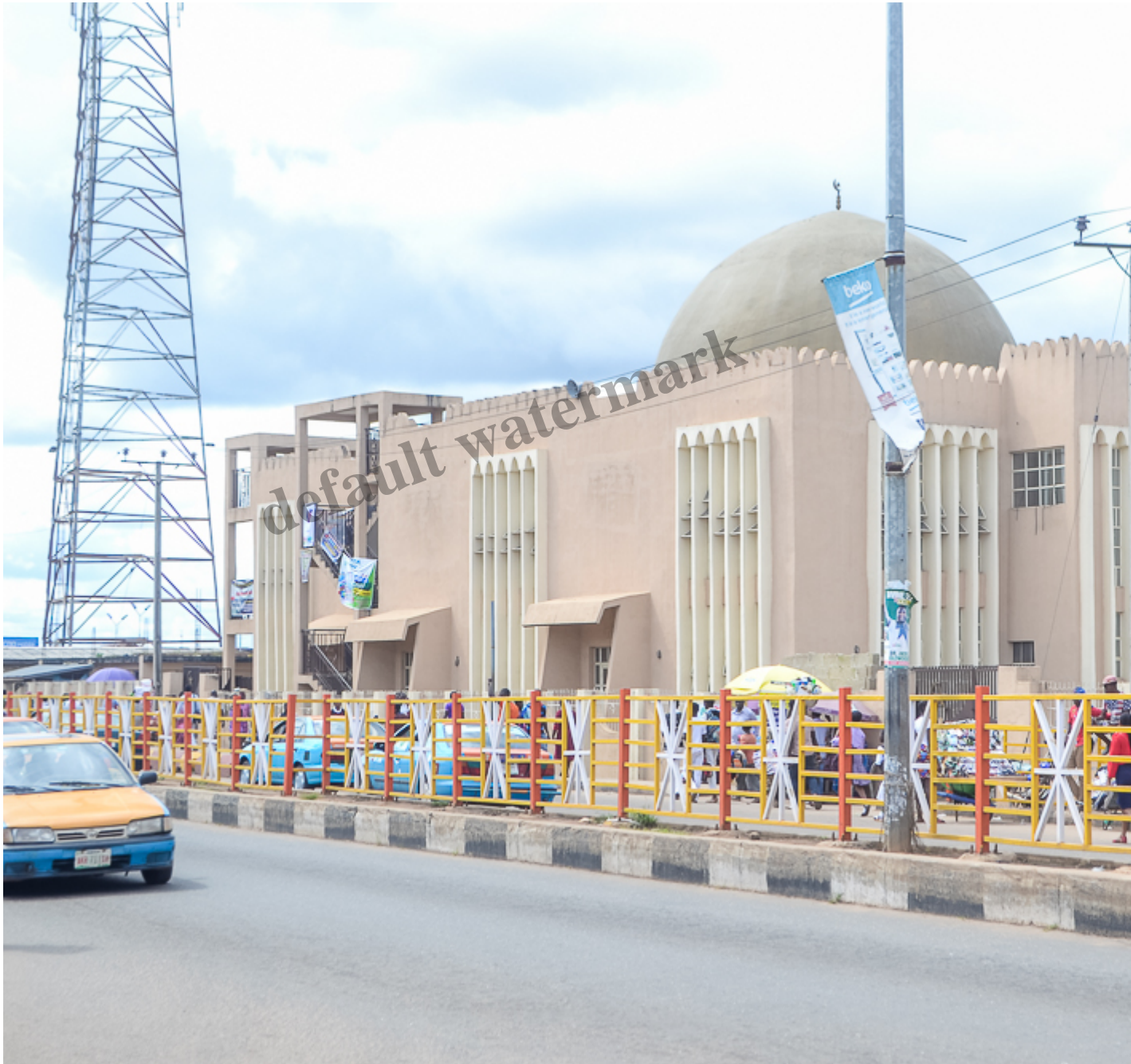
Akure City Ondo State Nigeria Nigeria