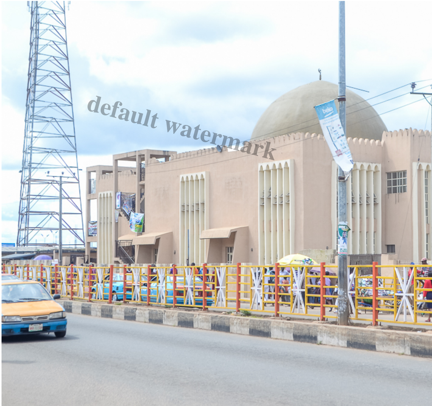
Akure City Ondo State Nigeria Nigeria