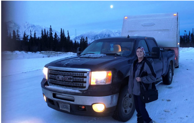
Rest stop above Haines Junction.

In Juneau, Cat was diagnosed in February 2018 with brain cancer. The lung cancer had metastasized. She received radiation treatment that further changed her mental capacity. We had one last glorious trip home to Anchorage after session before everything fell apart.