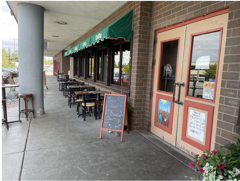
Outdoor seating is featured during summer at Garcia's Cantina and Cafe.