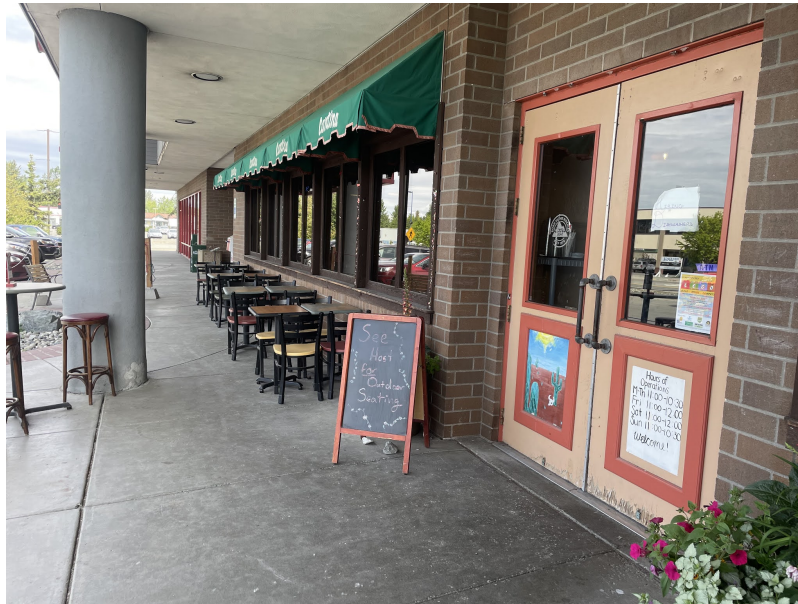
Outdoor seating is featured during summer at Garcia's Cantina and Cafe.