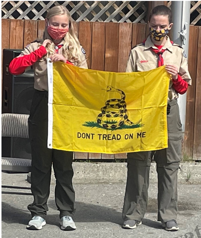
The Snake Flag established by the Southern Colonies of the US.

Local Scouts brought examples of each flag as it was explained by the speaker at the ceremony.