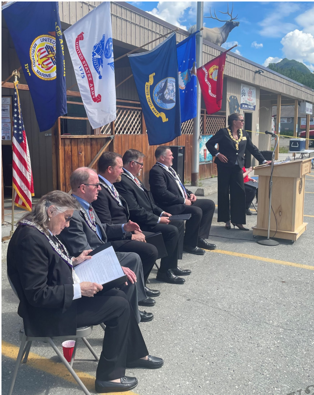
Officers of the Eagle River Elks Lodge #2868 prepare for the Flag Day program under flags of all our armed services.

The Elks Club gained recognition of Flag Day during the Presidency of Woodrow Wilson . The stated purpose of the service I attended this year is to honor our country's flag, to celebrate the anniversary of its birth, and to recall achievements attained beneath its folds . Further, the organization maintains: It is quite appropriate that such a service should be held by the Order of Elks , an organization that is distinctively American, intensively patriotic and without counterpart.