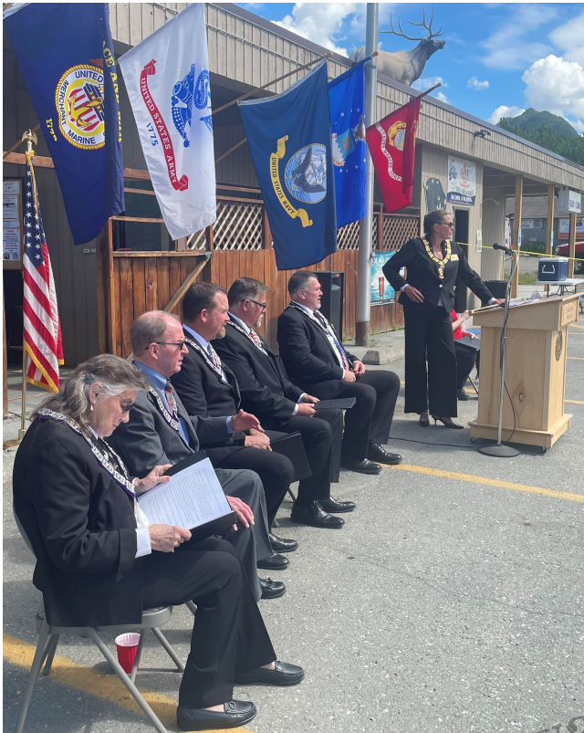
Officers of the Eagle River Elks Lodge #2868 prepare for the Flag Day program under flags of all our armed services.

The Elks Club gained recognition of Flag Day during the Presidency of Woodrow Wilson . The stated purpose of the service I attended this year is to honor our country's flag, to celebrate the anniversary of its birth, and to recall achievements attained beneath its folds. Further, the organization maintains: It is quite appropriate that such a service should be held by the Order of Elks , an organization that is distinctively American, intensively patriotic and without counterpart.