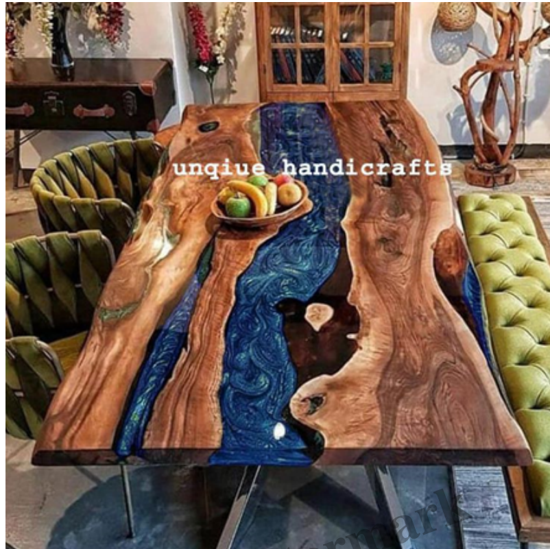
A River Table is made from a slab of wood enhanced with modern epoxy products available at Eagle River Sawmill and Kiln.

Wehrli continued: River tables have become very popular so I was able to land the state distributorship for the [5]Mas Epoxy, Wisebond Epoxy [6] and Rubio Monicoat. [7] with others on the horizon.