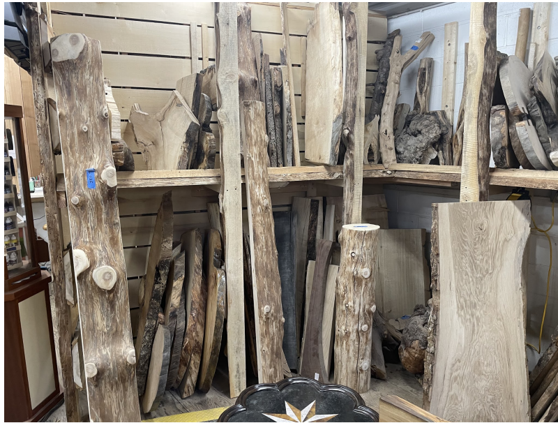
An array of wood for projects can be found at Eagle River Sawmill and Kiln.