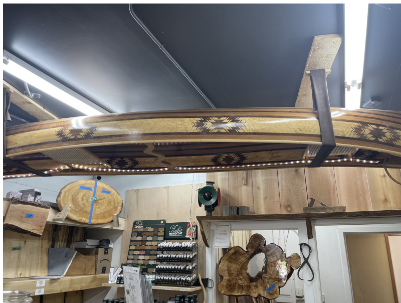
The showroom at Eagle River Sawmill and Kiln features a variety of amazing wooden products.

He chose to live in Eagle River in 1993.