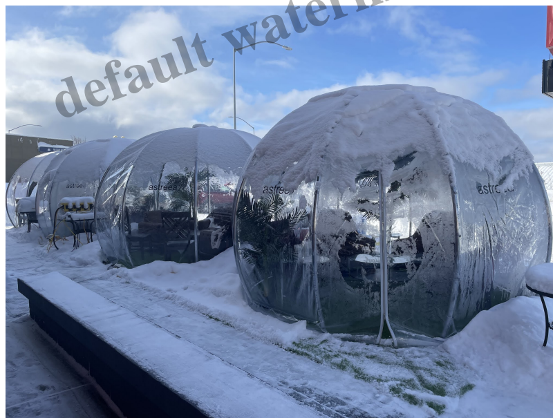
Each MBC location features four Igloos for guests. Tomter says they book fast most evenings.

Some might remember when MBC in Eagle River had a large white tent early in the Municipality of Anchorage business shutdown.